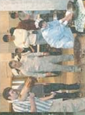
Traditional annual event "Mochi-tsuki", pounding of rice cake, is performed also in the Wakejuku every year for the New Year.